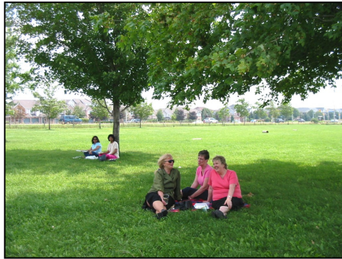
Picnic in the Shade

Every year we celebrate summer at the schoolhouse with a picnic lunch in the schoolyard. You bring lunch and the Friends supply the lemonade and cookies. The schoolhouse is open for visitors.