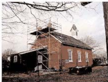
The schoolhouse was a construction site throughout most of the Fall.