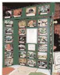
Garden display at Heritage Showcase in February

Other plans for 2005 include the enlargement of not only the shade and sun gardens for native perennials but also the gardens surrounding the school building. We are looking forward to the blooming of colourful bulbs planted last fall.