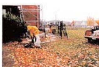
A new path is laid on a cold rainy day.