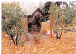
Replacing the fence around the outhouses