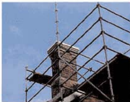
The new chimneys are almost completed and waiting to be capped.

The chimneys have been completely rebuilt using reclaimed brick. Any good bricks from the old chimneys were used to replace damaged ones in the walls. As the stove can no longer be used, the chimneys were capped with copper to extend their life. The necessary pointing was done and all cement mortar removed and replaced with soft lime mortar. The front step by the front door was discovered to be a broken stone covered with cement. This cement was pulling away and damaging the bricks. The old stone step was removed and replaced with a new one. Stained bricks on the walls were poulticed to remove stains. The exterior woodwork was scraped, primed and painted as was the flagpole. A lot of caulking also had to be done.