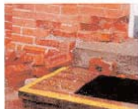
The stone front step needed to be replaced.

A number of other jobs were completed such as putting the mailbox on a cedar post, fixing the swings to make them safer, laying a flag stone path on the south side of the building, screening the outhouses with wire mesh inside to keep out squirrels and raccoons, fixing the outhouse privacy fences and a number of other small jobs.