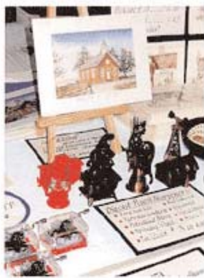
Greeting cards, pencil sharpeners and music boxes are popular items.