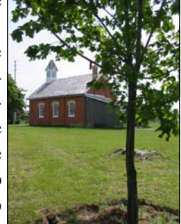
2007—New maples are planted.

On May 2 at 1:00 p.m. in the schoolyard, we will celebrate the 25<sup>th</sup> anniversary of the restoration and formal reopening of the Schoolhouse. To mark this very special occasion the four replacement maple trees, provided by the Peel District School Board, will be dedicated to some of the many individuals and groups who helped to preserve and restore this community treasure. We invite you to join us in this celebration.